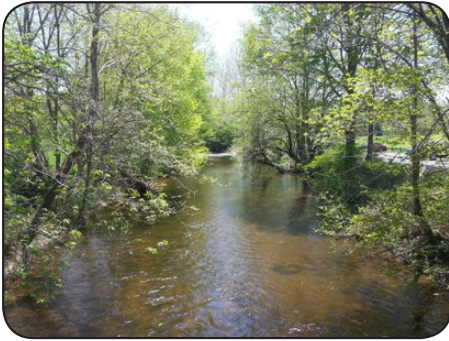
Weekeepemee River, Woodbury, CT.