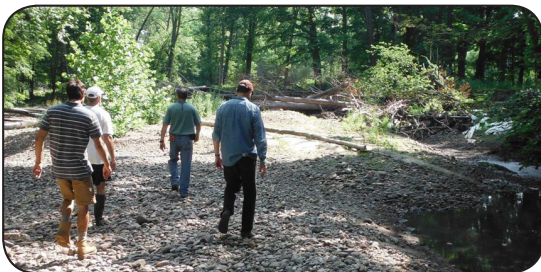
PRWC facilitates site visit to Pomperaug River with the Natural Resource Conservation Service.

Locally, PRWC has been actively engaged in numerous water resource protection matters. We are assisting our local communities with existing regulations and proposed changes for both Federal and State stormwater management programs. We facilitated a site visit meeting with the Natural Resources Conservation Service and our local community leaders as well as concerned neighbors regarding a stretch of the Pomperaug River where the channel has diverted from the historic river-course near Orton Lane in Woodbury. We provided observation and comments to the Southbury Inland Wetlands Commission on the proposal to construct Southbury Village Square (the location for the proposed movie theater), and we are currently making use of our science and research in our review of the proposed power plant in Oxford specifically related to its potential impact on water resources.